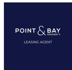
Leasing Agent 02 9357 1151